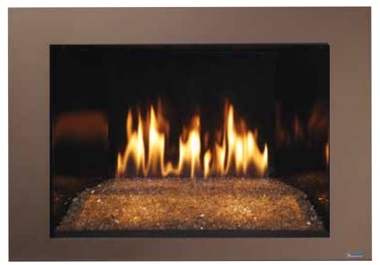
Shadowbox Face - Bronze