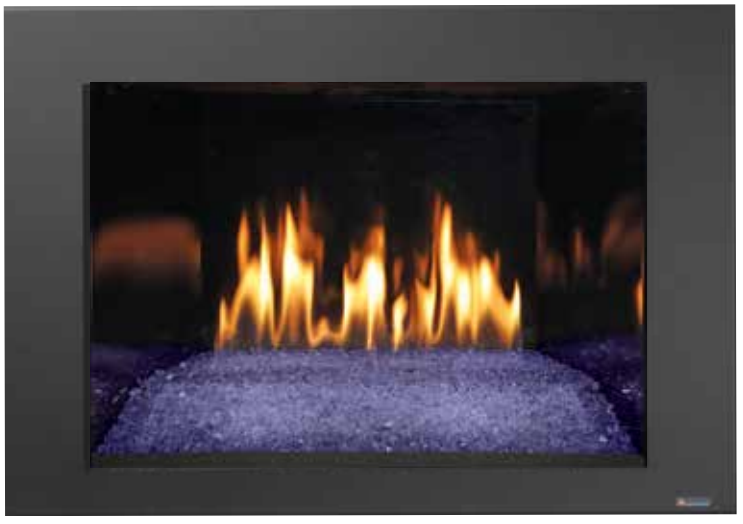
Shadowbox Face - Black