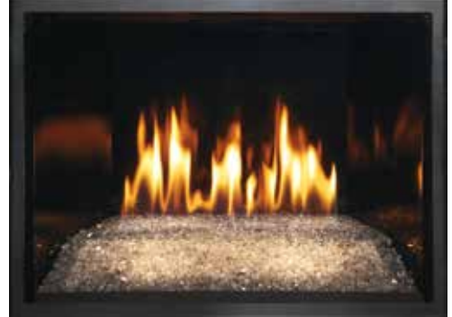
Black Enamel Fireback shown with Platinum Glass Media