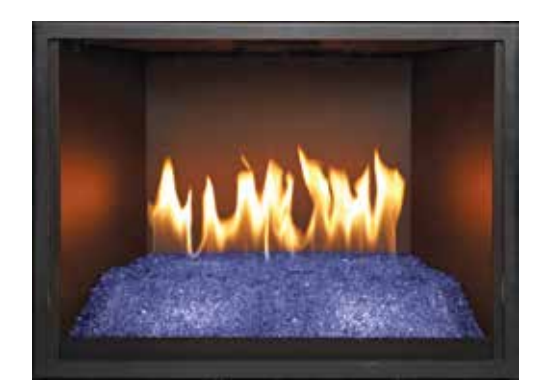
Black Painted Fireback shown with Cobalt Glass Media

Leave the interior basic black for a simple contemporary look, or add one of two decorative metal firebacks.