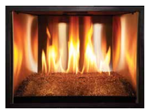
Stainless Steel Fireback shown with Bronze Glass Media