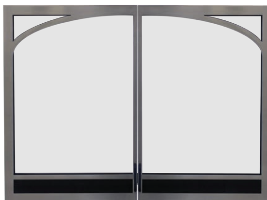
Alexandra Doors in Brushed Nickel

The available dimmer-controlled lighting kit draws attention to your American Hearth fireplace even when no fire is burning. Enhance heat distribution with the optional variable-speed blower.