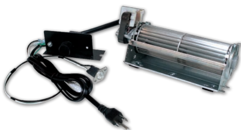
Optional Variable-Speed Blower