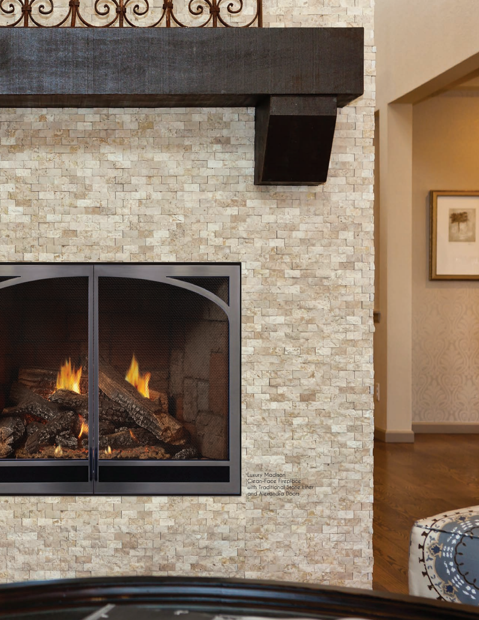
Luxury Madison Clean-Face Fireplace with Traditional Stone Liner and Alexandra Doors