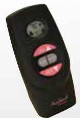
RCSITEA remote included on the TSC models