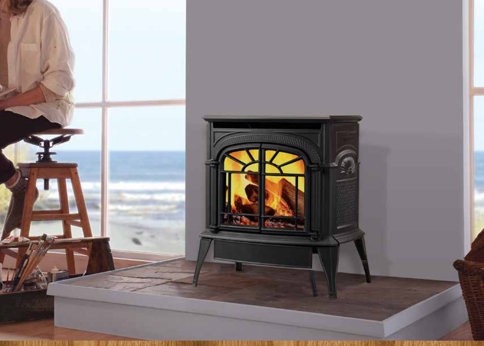
Intrepid® Direct Vent Stove in Classic Black