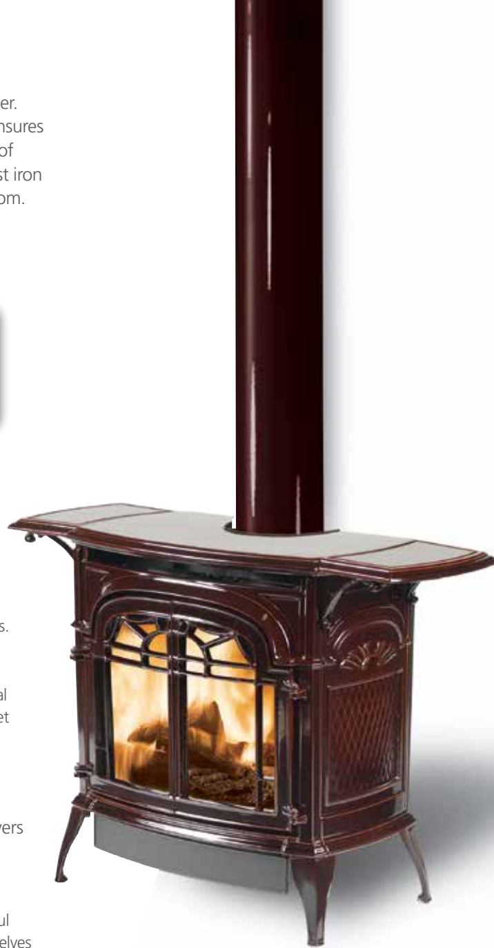
Stardance® Direct Vent Stove in Majolica Brown with optional Majolica Brown warming shelves

Add an optional fan kit to efficiently move heat around your room. The variable speed, heat activated fan maximizes the 18,5000 BTUs of heat generated by the Intrepid®.